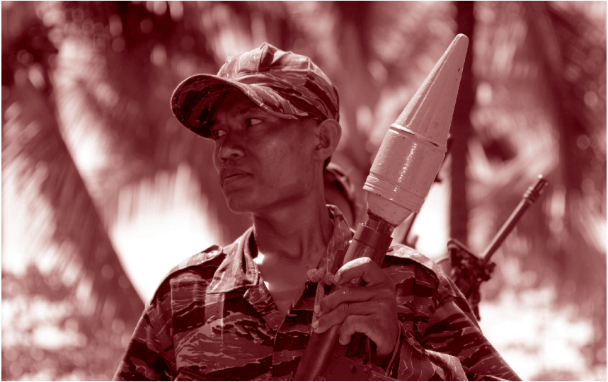
Rocket-propelled grenades are part of the arsenal of the Bangsamoro Islamic Armed Forces, the armed wing of the MILF.

The ideological foundations and activist nature of many Filipino armed groups steer the thematic discussions in Part One of this volume. Since the groups are more amenable to constructive engagements in peace processes and other human security endeavours than predatory or opportunistic armed groups would be, we chose to home in on human security efforts . While the human security impact of the insurgencies is a vital area of study, it has been well documented elsewhere. 2 Thus, the thematic chapters of Part One cover: the various peace processes and negotiations; ceasefires; counter-terrorism; disarmament, demobilization, and integration into the armed forces and police; and small arms control. Philippine armed groups are undoubtedly part of the human security problem in the country; a working hypothesis of this study is that the ‘primed and purposeful’ non-state armed groups must also be part of the solution.